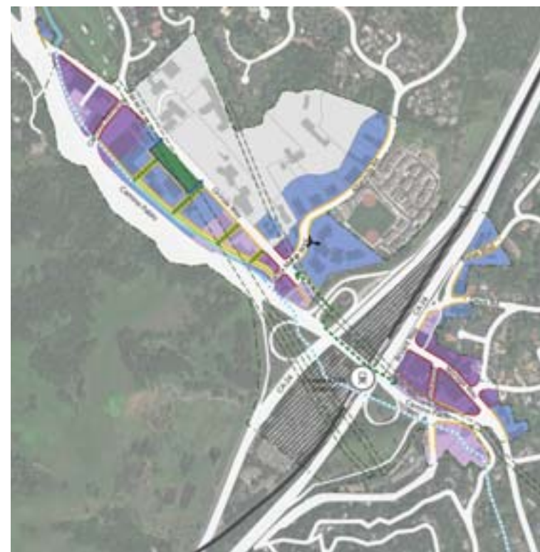
Figure 2.02.1 Regulating Plan, www.planorinda.com/